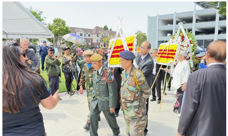
Delegations from the Vietnamese Nationalist Party and the Vietnamese National Council laid wreaths at the Vietnam - U.S. War Memorial in Westminster, California.