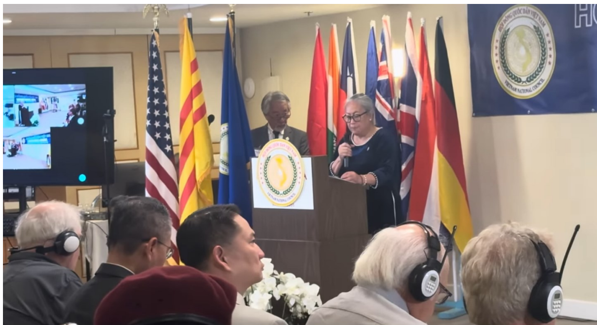
Program equipped with multi-languages translation system.

The entire program was equipped with multilingual interpretation headsets, enabling international delegates to follow speeches and discussions in real time.