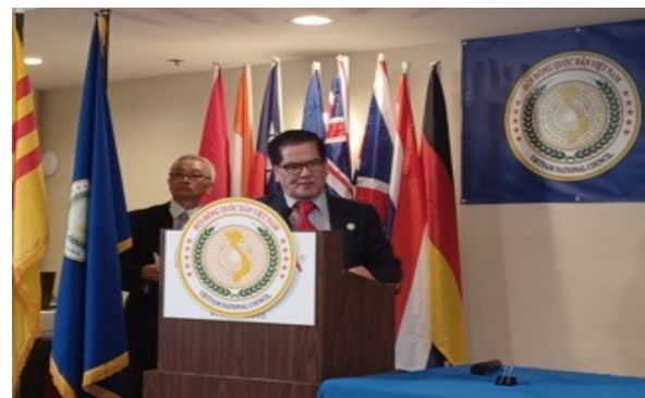
Elected officials, leaders of NYSE-listed companies, and community representatives received Certificates of Recognition from the World Citizen Government.